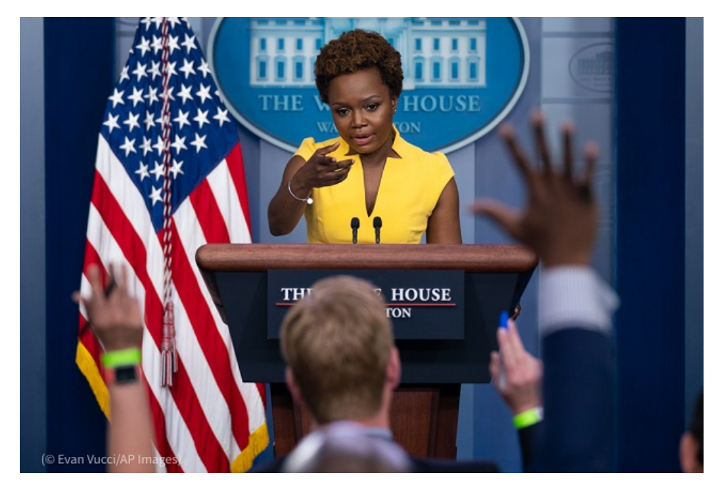
Karine Jean-Pierre speaks May 26 during a press briefing at the White House.

Secretary of Transportation Pete Buttigieg (above) is the first openly gay person confirmed to serve in a president's Cabinet. As head of the U.S. Department of Transportation, Buttigieg is tasked with improving America's transportation systems by increasing safety, improving infrastructure and engaging with innovative technologies.