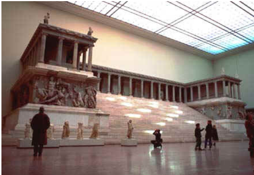
Pergamon Altar – Satan's Seat of the Book of Revelation

Occultists and agitators often try to provoke the opposition into a hysteria. Obama hopes we will overreact and can be marginalized and made an object of ridicule. In that way he can animate his cult-like following.