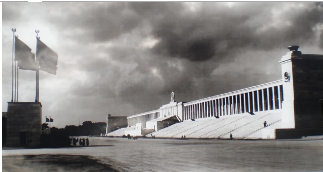
Tribune at the Zeppelin Field in Nuremberg (Click for more info)

Below is an image of one of the rallies in Nuremberg at the Zeppelin field in front of the tribune modeled after Satan's Altar of Pergamos. Most Germans probably did not realize that they were heiling Hitler, while he addressed them from a perverse replica of Satan's Throne of Revelation, or maybe they just did not care. It was an omen of the apocalypse to come. An early Christian martyr was burned at Pergamos as a sacrifice. Hitler used the altar as his tribune and slaughtered 10 million Christians and Jews as his "sacrifice." Now, Obama has used a similarly designed temple as his own tribune in his nomination convention.