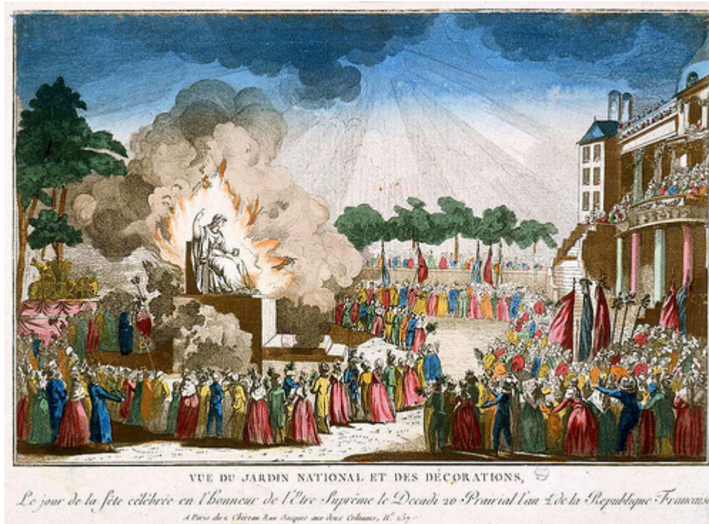
The Throne of Robespierre, Dictator of France

Another example of worship of leaders comes from the French Revolution. Like Obama and Adolf Hitler, the leader of the Jacobins and dictator of France, Robespierre, constructed a throne, so that he could be worshiped like a god at the fests of the Cult of Reason, also called the Cult of the Supreme Being. This was a Luciferian religion, which was made the state religion of revolutionary France. This painting depicts Robespierre seated on his throne. A small artificial mountain was built for the throne and he would mount the throne wearing a toga during the festivities of the cult.