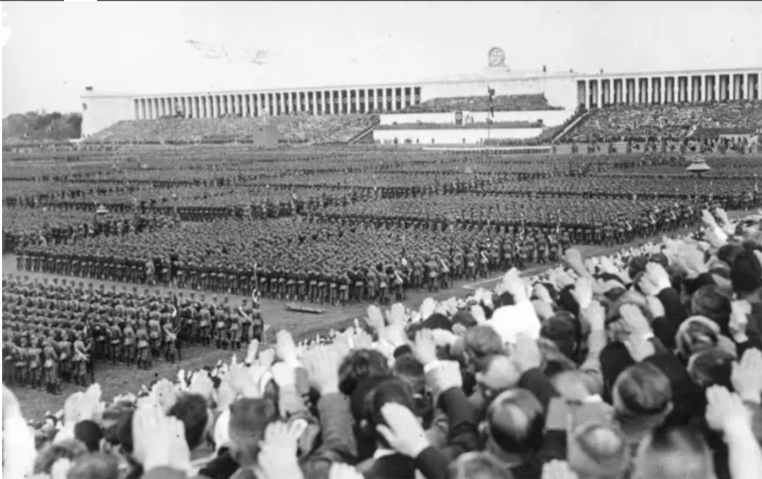
September 1937

Reichsparteitag – Hitler speaks from his Throne of Satan